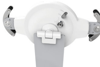
Thin Tablet Holder